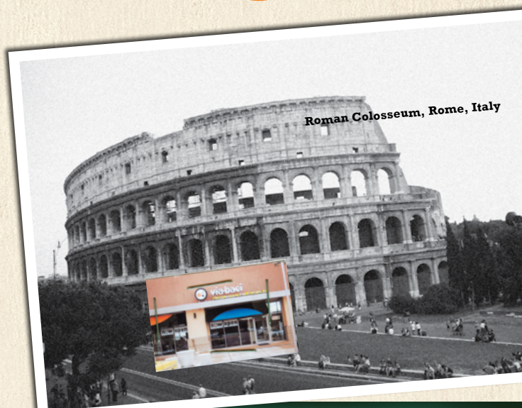
Roman Colosseum, Rome, Italy